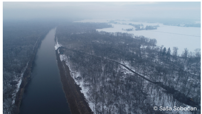
Implementation of works – riverbed widening.